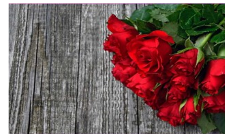
It is love that gives value to everything - Suzanne Aubert

Billings Ovulation Method —TM Training Seminar: Natural Fertility Awareness | Nelson, 29 & 30 September 2023- Billings Ovulation Method™ is a Fertility Awareness Method used by couples to prevent or achieve pregnancy and monitor general and reproductive health. This seminar will benefit health professionals, those interested in women’s health and fertility, those wishing to become accredited Billings Teachers, and those using or considering using the Billings Method. To register or further details, email info@billingslife.org.nz or visit